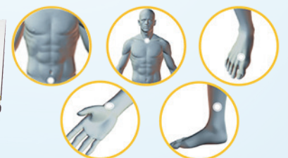
• Patented form of phototherapy