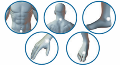
• Patented form of phototherapy