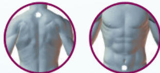
• Patented form of phototherapy